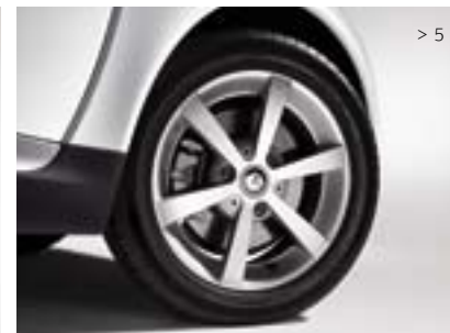
> 5 6-spoke alloy wheels (15", design 3): For tyres measuring 175/55 R15 (front) and 195/50 R15 (rear).