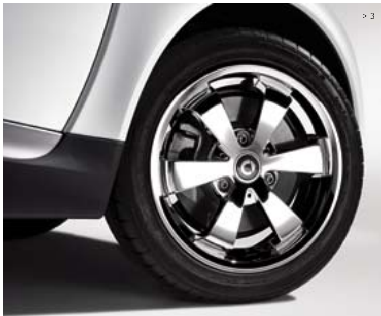
> 3 6-spoke alloy wheels (15", design 5, chrome look): For tyres measuring 175/55 R15 (front) and 195/50 R15 (rear). Optionally available in titanium silver (design 5, not shown).