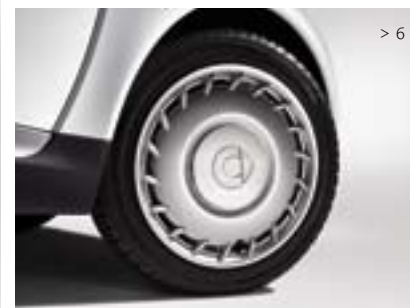
> 6 Wheel trims: Enhance the standard steel wheels and protect the wheel fastening bolts from the elements. Not just ideal for winter wheels.