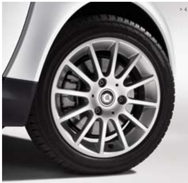
> 4 12-spoke alloy wheels (15", design 1): For tyres measuring 155/60 R15 (front) and 175/55 R15 (rear).