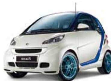
landspeed white style