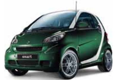
jolly old green style