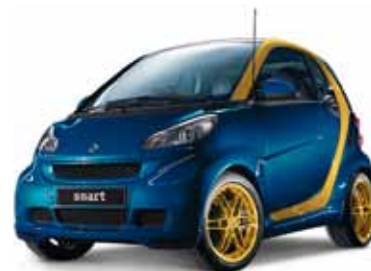
champions charge style