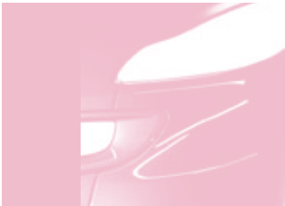
very smart pink