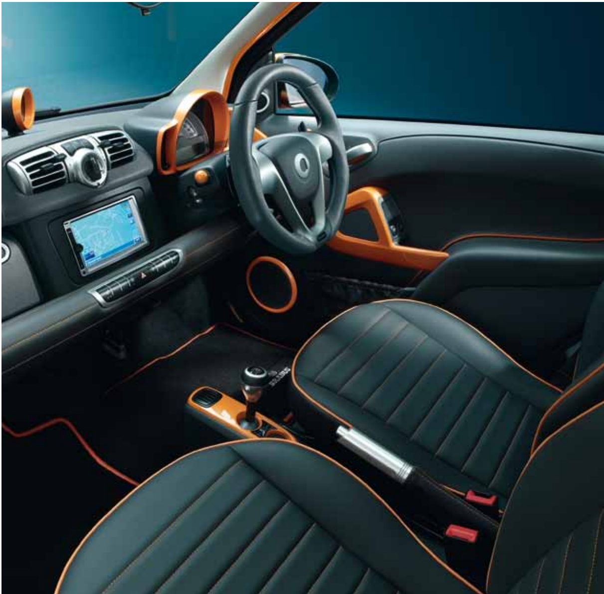
Black leather BRABUS sports seats and upper dash knee pads shown here with orange stitching and piping.