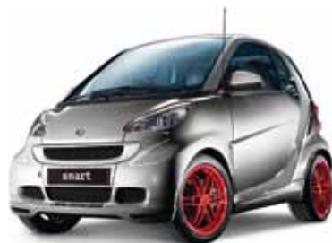
super arrow silver style