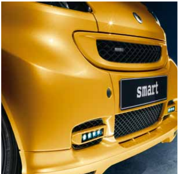
BRABUS grille badge and front LED lighting.