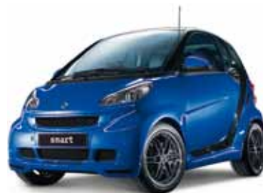
mexican sky style