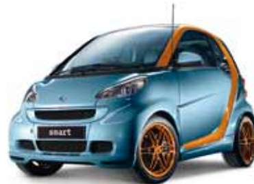
sarthe circuit blue style