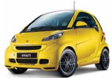
senegal yellow style