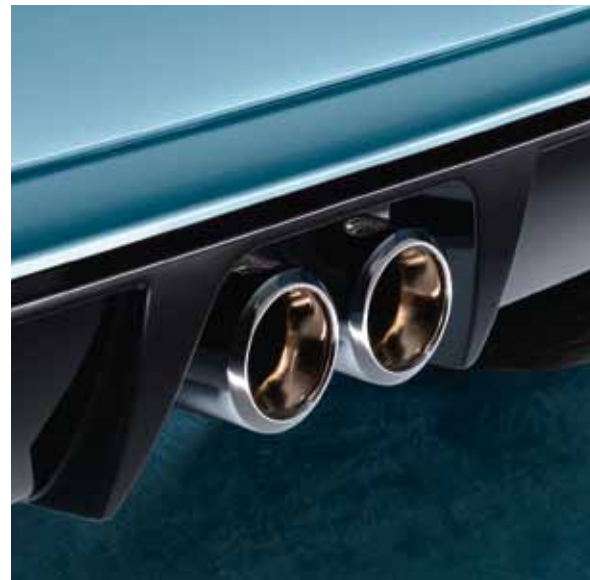
Centrally positioned twin tail pipes in brilliant chrome.