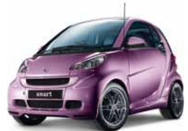
demon lilac style