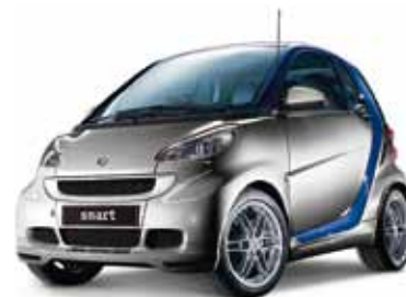
smartbach 27 style