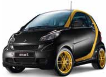
special black style