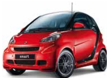
smart rally red style