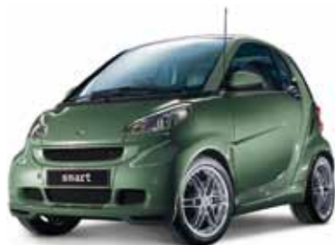
pagnell sage style