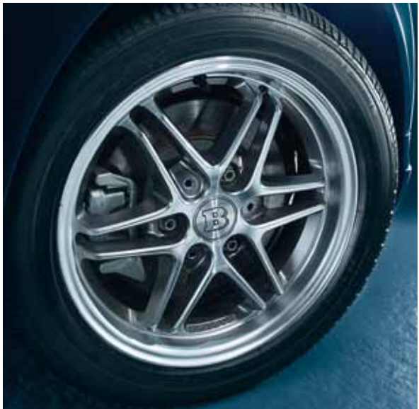
Six-twin-spoke BRABUS Monoblock VII 15" wheels in standard silver.