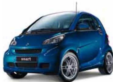
molsheim blue style