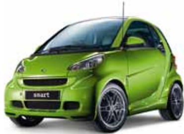
graceful green style

These are just an illustration of what can be done, however. When it comes to your own smart, the only limit is your imagination.