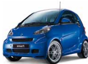
byfleet blue style