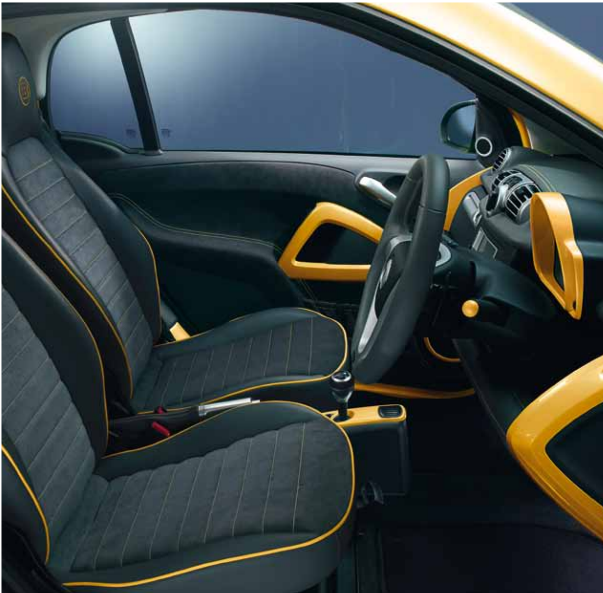
Trim highlighted in miurello metallic yellow. Seats in black leather with black Alcantara® inserts shown here with yellow contrast stitching.