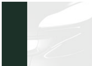
jolly old green