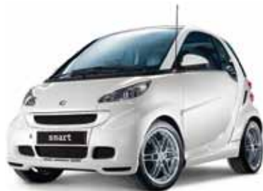
phunki bari style