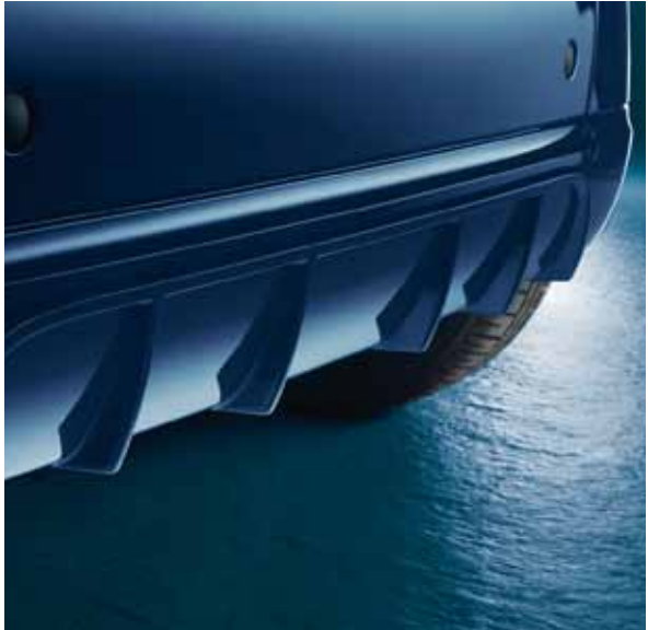
The body colour rear apron lends a sporty touch to the rear end.