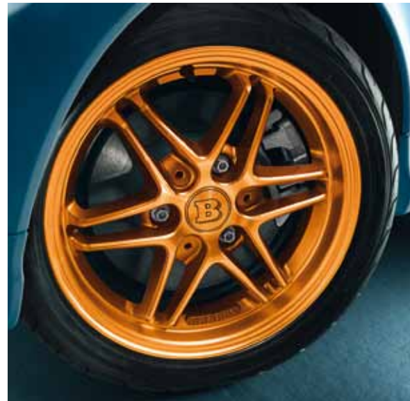
BRABUS Monoblock VII 16" and 17" alloy wheels.