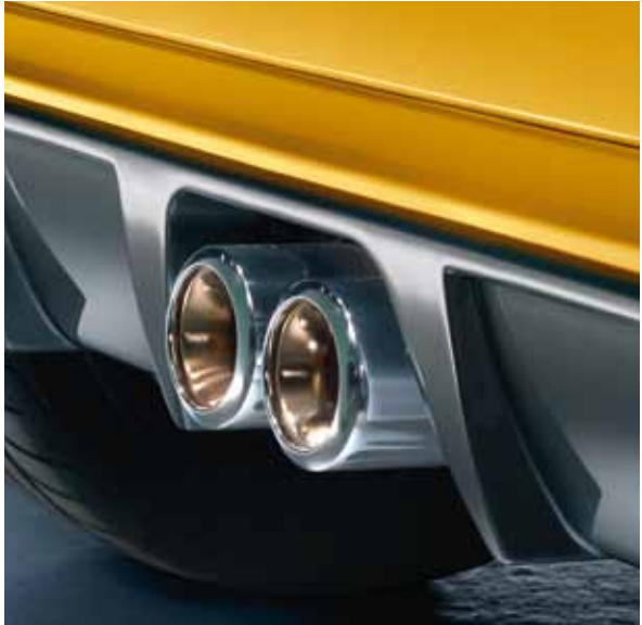
Open rear diffuser shown here in gunmetal.