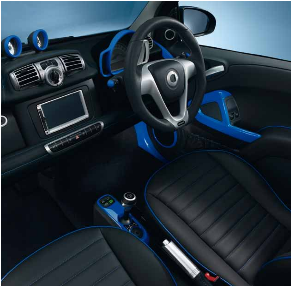
The tailor made package, shown here with Molsheim Blue interior highlights. BRABUS seats in black leather boast blue stitching and piping.