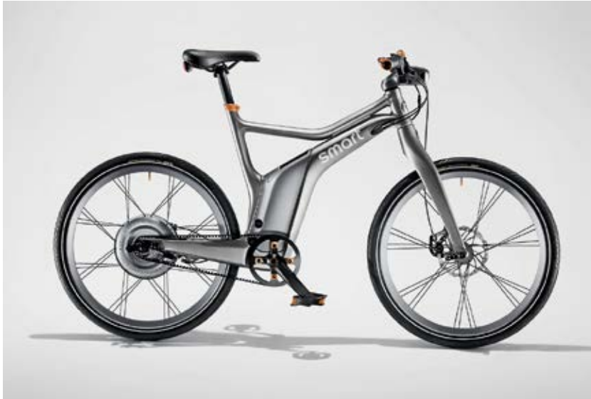
Matt grey/flame orange