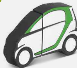
USB stick. White/black/energy green. Plastic. In the shape of the smart electric drive. USB 2.0. 4 GB capacity, writing speed 3 MB/s, reading speed 12 MB/s, size 31 x 51 x 11 mm. B6 799 3551