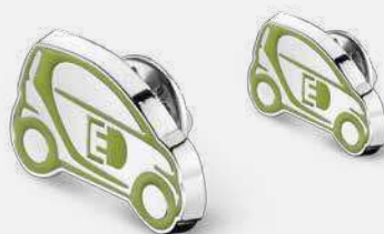
Pin. Silver/green. Stainless steel. Clothing-friendly clasp. B6 799 3022