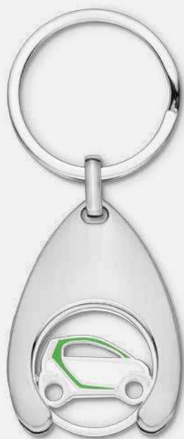
Key ring with shopping trolley chip, electric drive. Stainless steel. Key ring with shopping trolley chip. Length approx. 7.5 cm. B6 799 3021