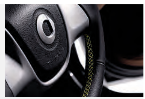
Loving attention to detail

Stitching in light lemon on the seats, instrument panel and leather steering wheel rounds off the overall impression.