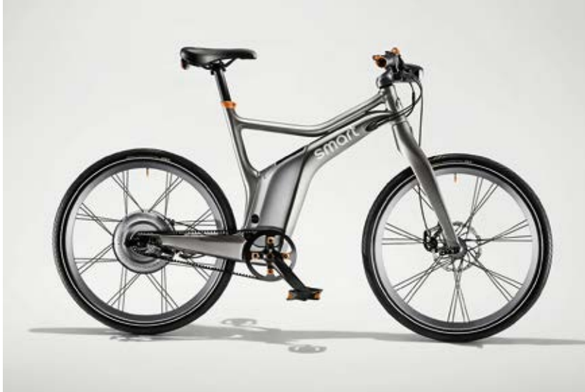
Matt grey/flame orange