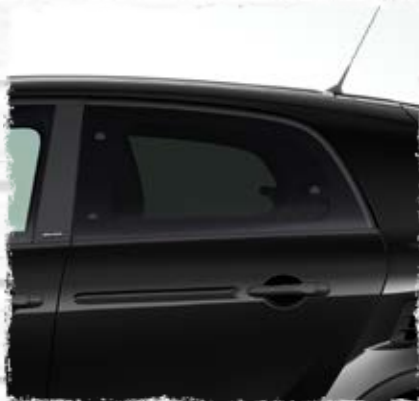
Privacy glass (for four only)