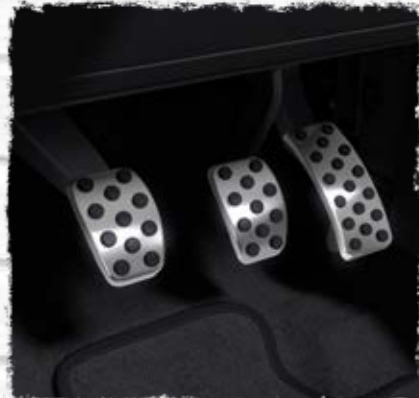
Brushed stainless steel sports pedals with rubber studs