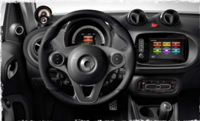
3-spoke sports height-adjustable sports steering wheel with perforated leather, smart Media-System and automatic climate control