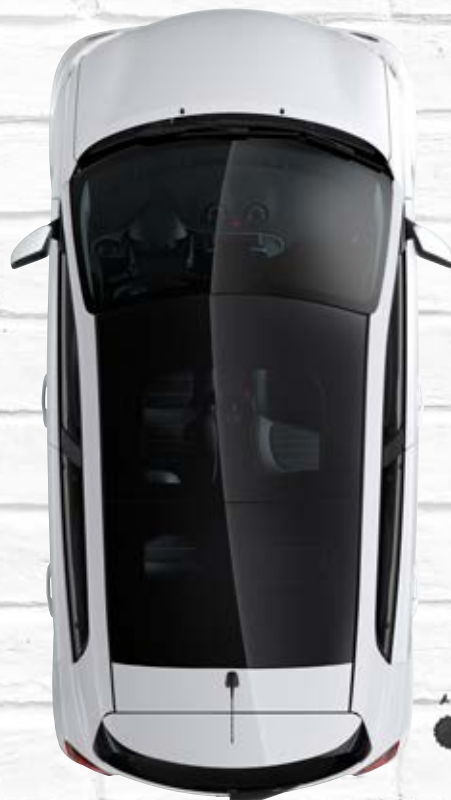
Panoramic roof with sun protection