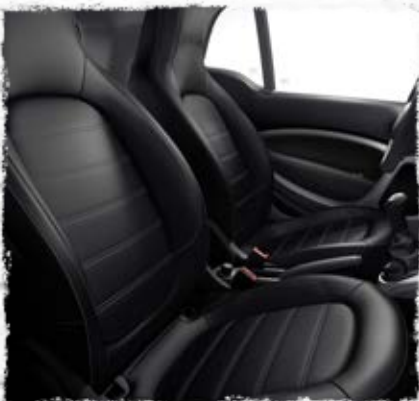
Upholstery in black leather with grey topstitching, height-adjustable driver's seat, heated front seats