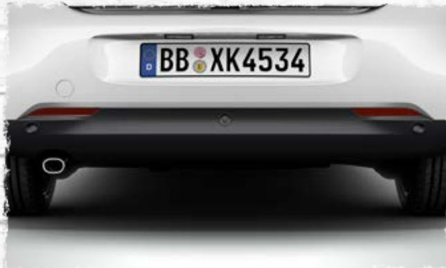
Exhaust system with chrome-plated tailpipe and rear parking assistance