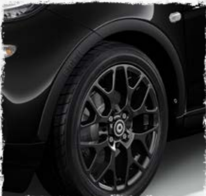
Wheel arch extensions with smart lettering and 16" 8-Y-spoke alloy wheels painted in black